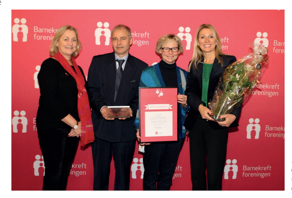
For Christmas 2017, Kvaerner donated 500 000 NOK to the Children's cancer society instead of aifts to the employees.

charity organisations or other non-profit organisations during 2017. The main areas for these donations were education, health, sports, culture, support to nongovernmental organisations, and other social welfare causes.